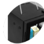
6 pre-drilled valves for milk hoses