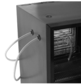
6 pre-drilled valves for milk hoses